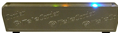
Front with power & channel activity lights

Models UC-02B & UC-04B 2 or 4 channels record to PC hard drive