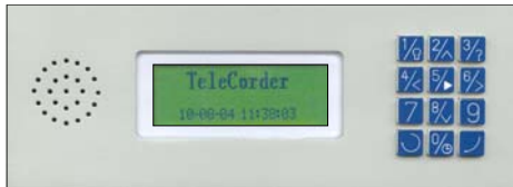
Front with speaker, LCD display, & keypad

Models TC-02F & TC-04F 2 or 4 channels with built-in hard drive