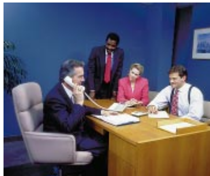
Group Call Monitoring allows everyone in the office to hear the whole story without using the speakerphone.

Speakerphone - make or answer any call while you keep your hands on the job.