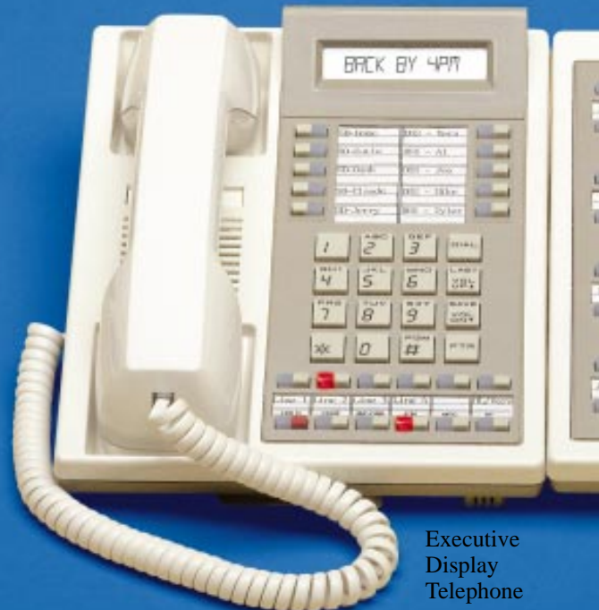
Executive Display Telephone