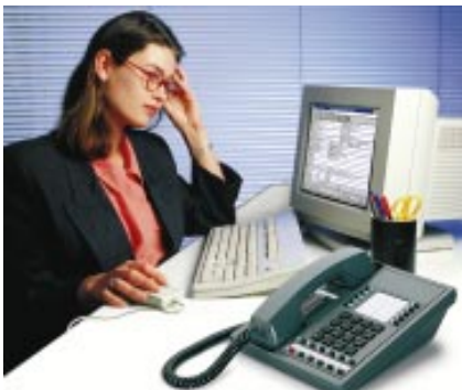
Digital System/01 automates your office with TAPI compatibility and external PC control.

Telemarketing Dial - enables your staff to canvas prospects quickly and efficiently.